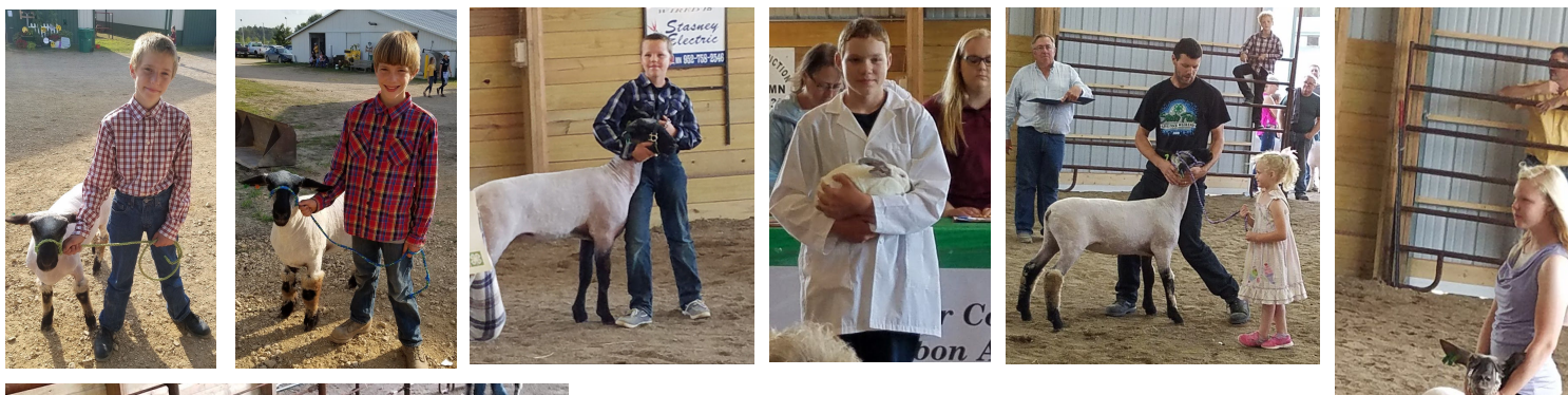
Pictured are some of the ribbons earned by your Minnesota Farmers at the Le Sueur County Fair.